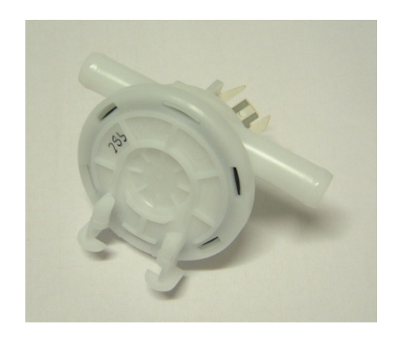
An example of a flow meter.

This defect can be caused by, but not only, a defective pressure switch which is sometimes referred to as a pressostat level and is located underneath the appliance.