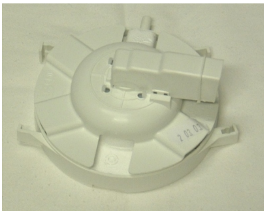
An example of a float switch.

This defect can be caused by, but not only, high water pressure or a defective pressure switch which is sometimes referred to as a pressostat level and is located underneath the appliance.