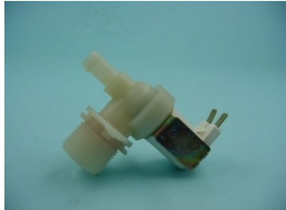
An example of a solenoid valve.