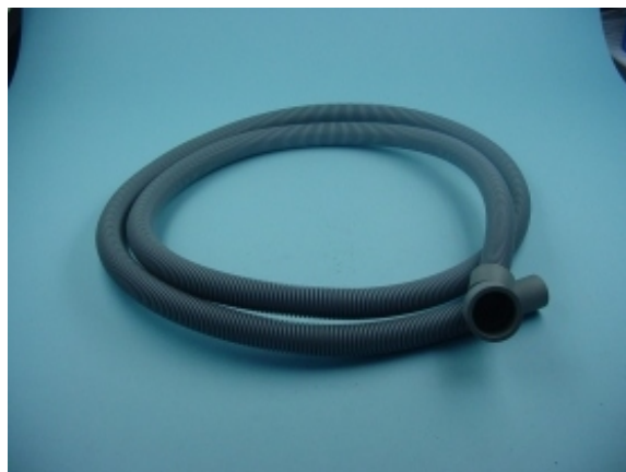
An example of a drain hose.