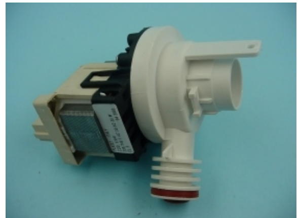
An example of a drain pump.