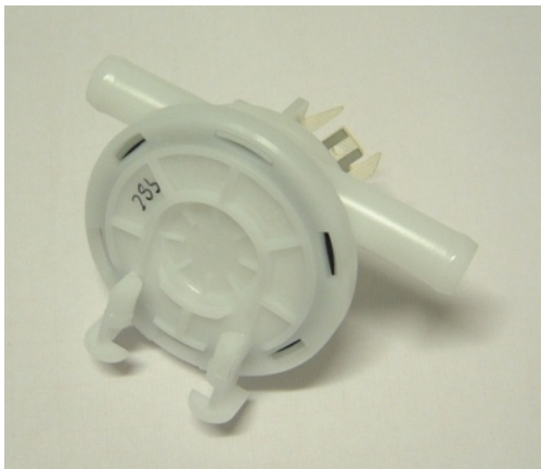
An example of a flow meter.

This defect can be caused by, but not only, a defective pressure switch which is sometimes referred to as a pressostat level and is located underneath the appliance.